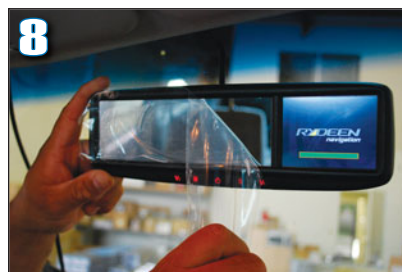
8 Plug in the DIN cable and test the unit. Turn the key to ACC and the unit should turn on. Hide the DIN connector and reassemble the vehicle.

For more information call (877)777-8811 or visit rydeenmobile.com .