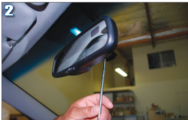
2 Remove the old mirror and unplug if necessary. The mirror is usually attached by a single screw. If a wire harness was attached, stuff it behind the headliner. It will not be used with the new mirror.