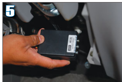
5 Find an under-dash location for the control module. If you're installing a back-up camera or other video source, plug them in. Mount using wire ties and or adhesive tape.