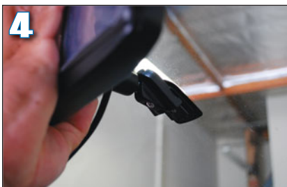
4 Mount the navigation mirror using the supplied screw. Slide it onto the factory mounting base and carefully tighten until secure.