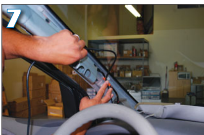
7 Route the DIN cable up the A-pillar, avoiding pinch locations or the side airbag. Leave any slack below the dash to avoid excess wire behind the headliner.