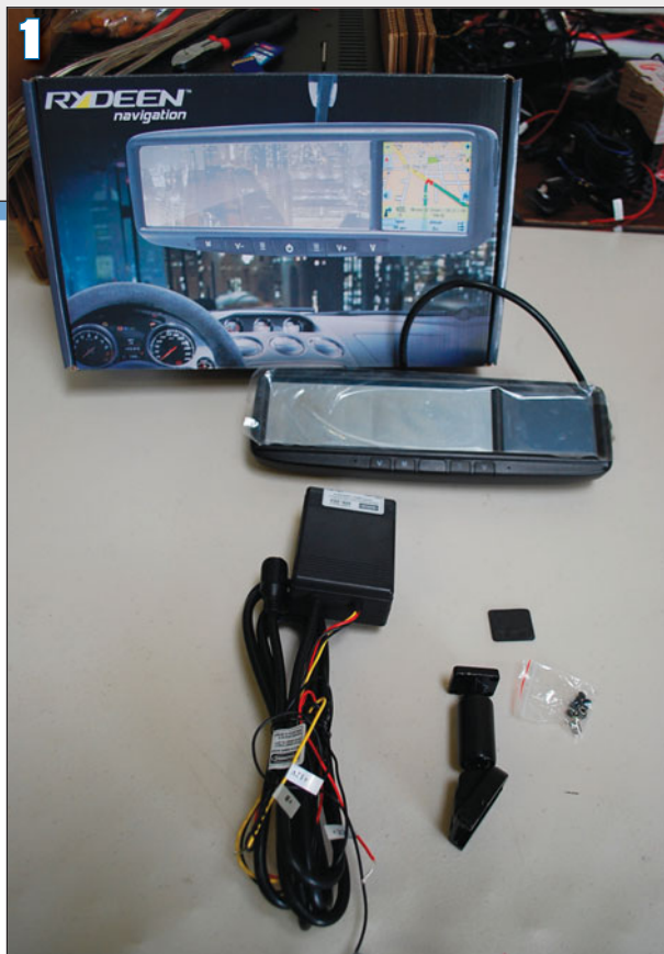
1 Make sure you've got all the parts. The box contains the mirror unit, wire harness / control module, and an instruction manual. Additionally, you should have the vehicle-specific mounting stem, which comes separately.

Here's another way to take care of customers who want the latest gadgets, but don't want to give up the factory radio: move to the mirror. Rydeen's navigation mirrors, the 10-inch MN302 and 12-inch MN305, build a lot of features into a replacement mirror unit, including touch-screen navigation, Bluetooth and a photo viewer. Here's the installation procedure.