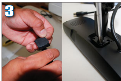
3 Prep the navigation mirror. Attach the adhesive pad to the mirror stem, lining up the holes. Secure the stem to the back of the mirror with the supplied washers and screws, starting with the holes nearest the top of the mirror housing.